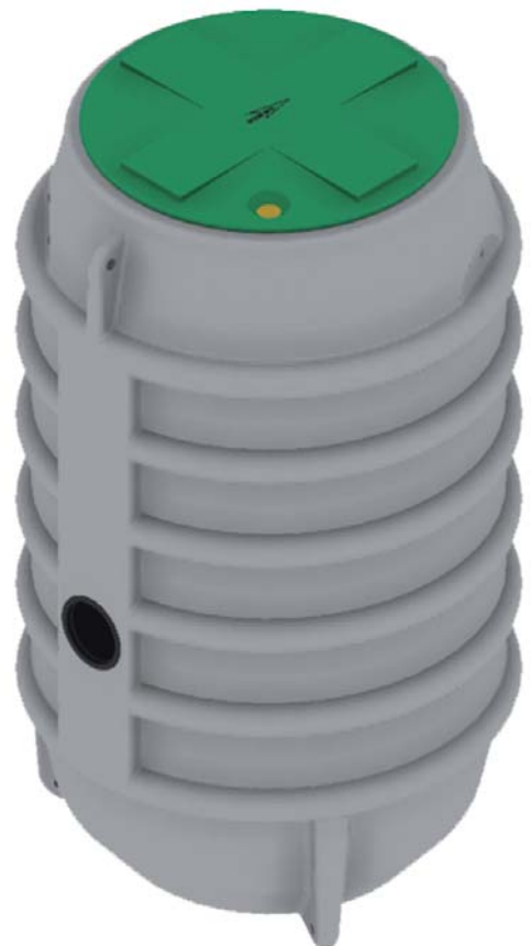
Micro 10 DN50 & DN65 version Tank Height 2000mm Tank Diameter 1100mm 1900 litre tank.