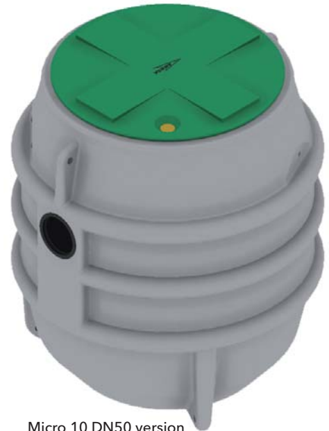
Micro 10 DN50 version Tank Height 1300mm Tank Diameter 1100mm 1200 litre tank.