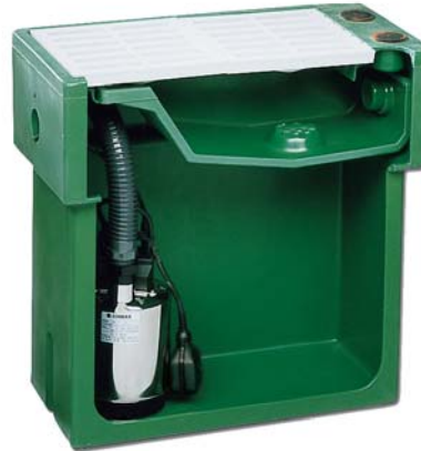
Minibox Series 85 litre tank.