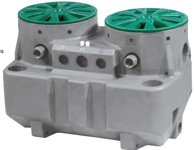
Micro 6+6 Series 550 litre tank.