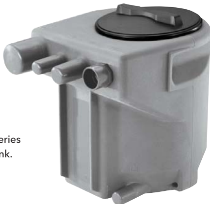
Micro 4 Series 80 litre tank.

MICRO 4 Series Prefabricated lifting station for clean and grey water according to EN 12050-2 standard.