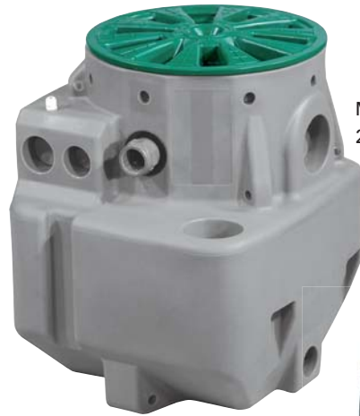
Micro 6 Series 270 litre tank.